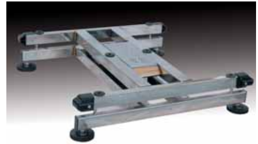
Detail of the stainless steel structure